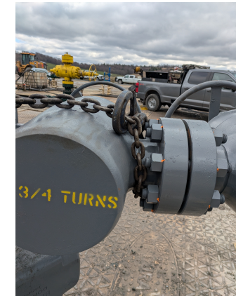
2. Area of sling lodged