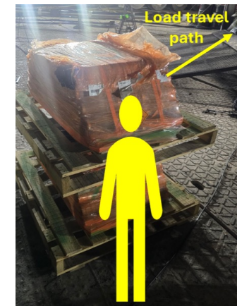
4. Stacked pallets of gun barrels