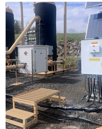
3. Misstep on crossover